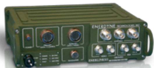
EnerLinksII Ground Modem/Receiver

Like the EnerLinksII data link system whose protocols and waveforms it shares, the DVA system has unsurpassed RF coverage. The GMR uses a high-performance all-digital bit synchronizer that acquires in milliseconds and reliably maintains lock, even at a signal-to-noise ratio less than 0 dB. The turbo product code FEC provides near error-free performance when the modem produces a BER less than 1%. This yields a receiver threshold of -96 dBm; 12 dB better than most analog FM receivers. When the digital diversity combining feature is used in channels impacted by multipath fading, an additional 6 dB of improvement can often be obtained.